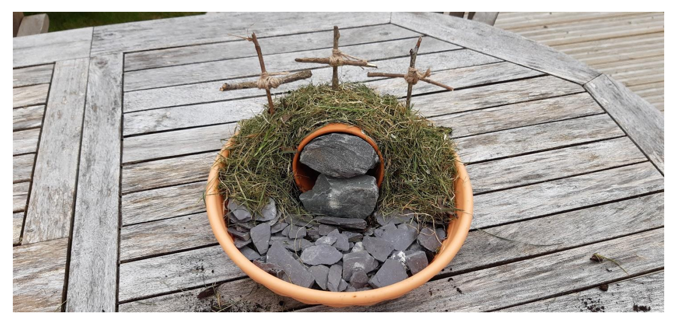
This is also available online at <a href="https://ucgrace.co.uk/Blog/create-your-own-easter-garden/">https://ucgrace.co.uk/Blog/create-your-own-easter-garden/</a>.