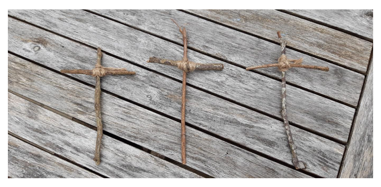
Finally, place the crosses on the hill and the stone across the tomb and place some where as a reminder. Don't forget on Easter Sunday to roll the stone away and have a party! If you make one, why not share with others what you have done and why.